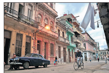
CAROLYN COLE Los Angeles Times