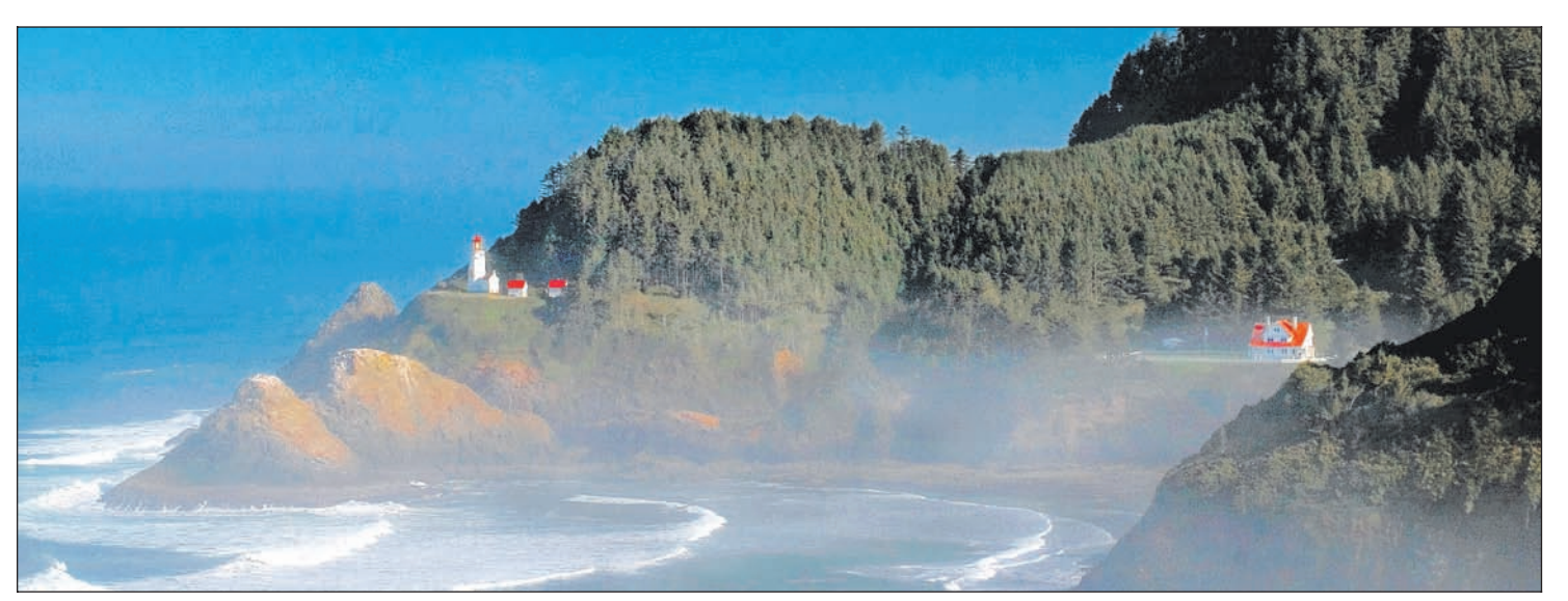
OCEAN VIEWS are part of the experience at the Heceta Head Lighthouse B&B. Florence, the nearest town, is 15 miles away.