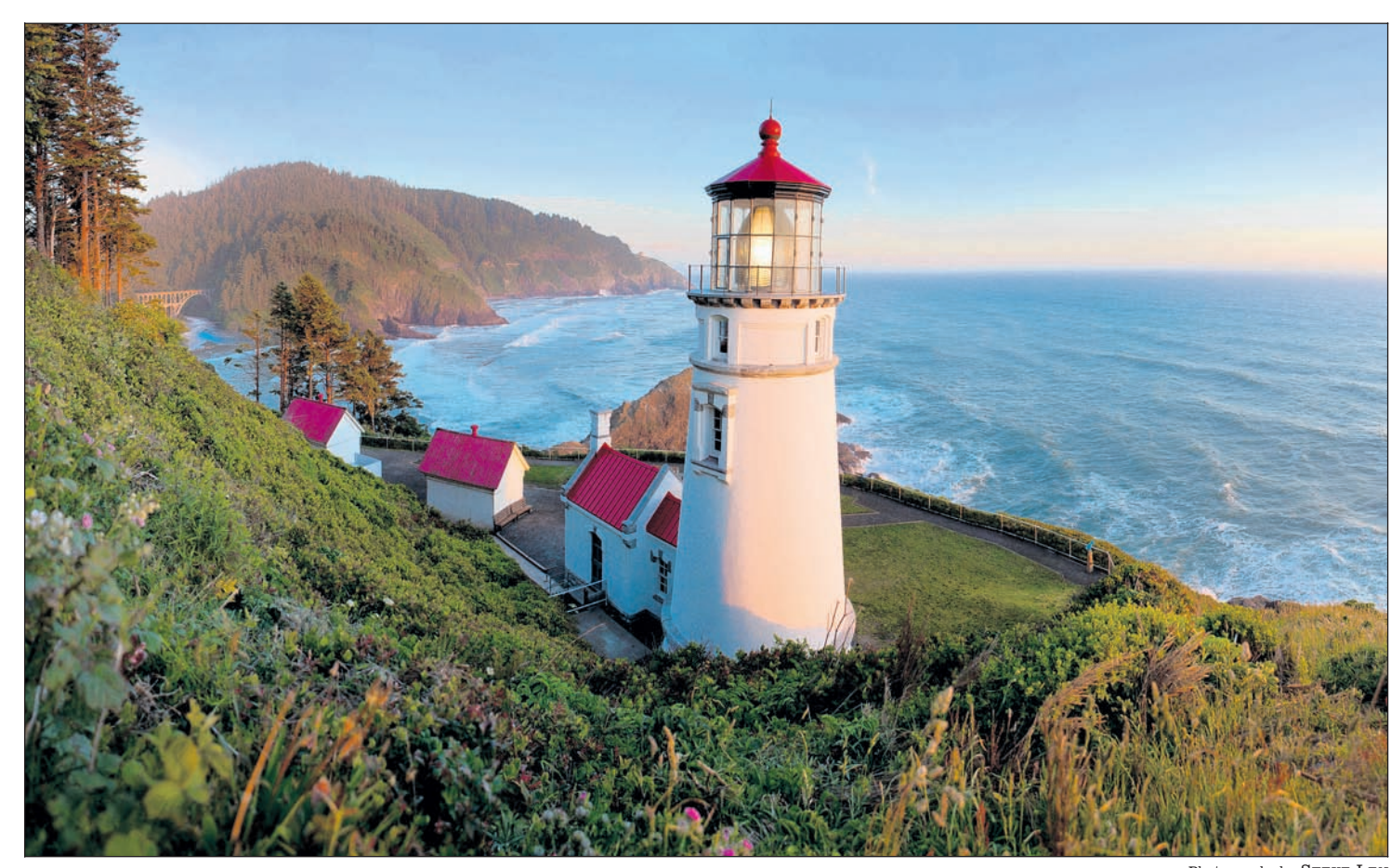
THE LAMP at the Heceta Head Lighthouse on Oregon's rough central coast casts beams visible up to 21 miles out to sea.