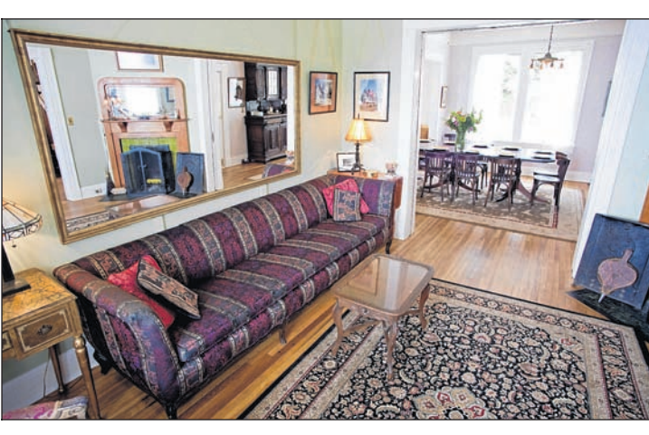
THE HECETA HEAD Lighthouse B&B was once the lightkeeper's cottage and beckons visitors with its two large parlors.